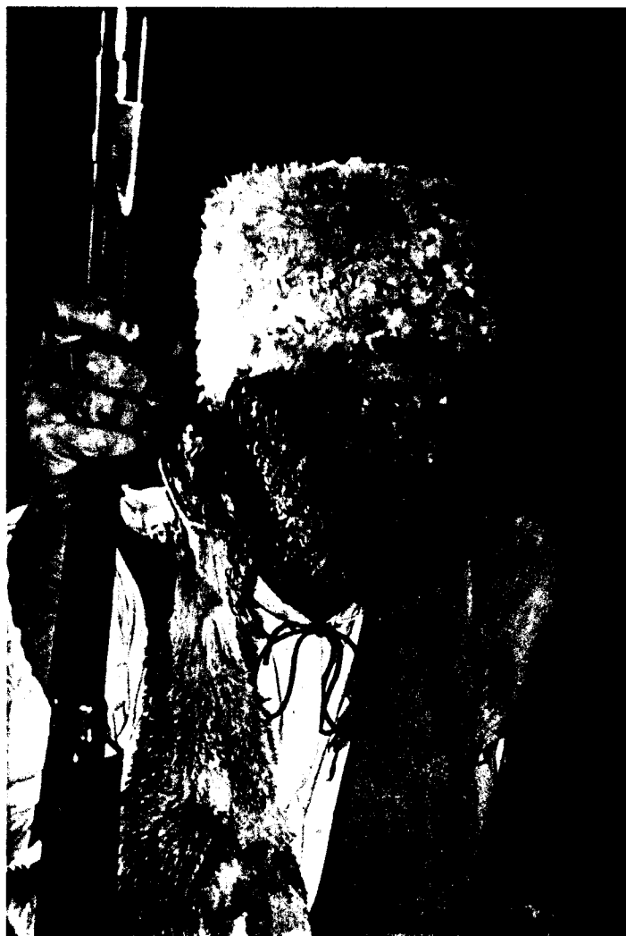
KAYE AT LIVING HISTORY DAY 1991 (RIGHT)