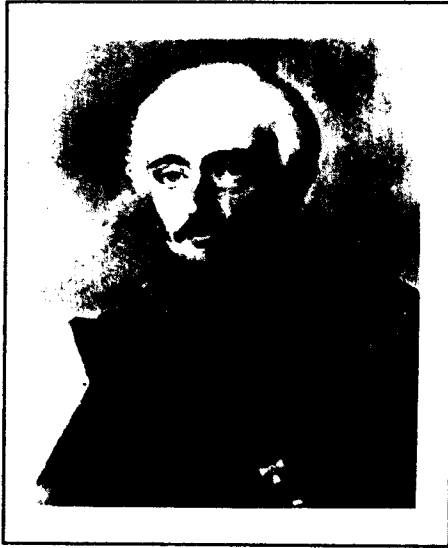
Ferdinand von Wrangell

Ferdinand von Wrangell (in Russian: Vrangel'), a nobleman of Baltic German origin, was educated among the elite of the Russian Empire. A graduate of the Naval Academy and a science student at the University of Dorpat, in Russian Estonia, Wrangell first visited the New World (and California) with Capt. Vasily Golovnin in 1818. After directing explorations in north-eastern Siberia and heading a scientific voyage to Kamchatka in the North Pacific, Wrangell in 1828 was appointed Manager-in-Chief of the Russian American Company colonies. Arriving in Sitka (New Archangel), Alaska, with his family in 1830, he served for five years as the Company's top executive officer in North America. We can assume that by the end of his term he had collected the seven California Indian objects now located in Frankfurt (Museum für Volkerkunde; see Blackburn and Hudson 1990: 103).