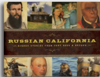
Russian California: Hidden Stories from Fort Ross and Beyond (with $100 Donation)

Becoming a member of Fort Ross Conservancy promotes stewardship of Fort Ross and Salt Point parks. Benefits of initial membership and annual renewals are, monthly electronic newsletters, and 10% discount on purchases (including mail orders) at the Visitor Center Bookshop.